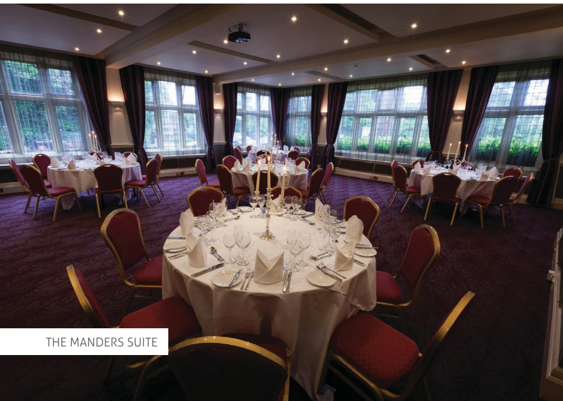
THE MANDERS SUITE